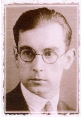
Enters the University of Zurich, 1926