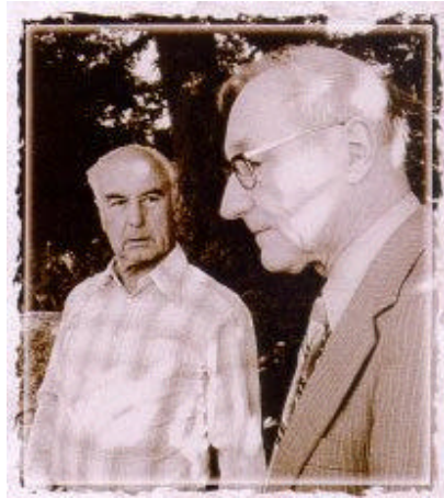
With William Burroughs, 1978